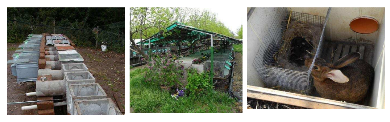
Figure 1: Building an underground cell system. A tube is connecting cells (right) with cages (left).

The experimental on-farm conditions were already described in González-Redondo and Finzi (2016). Two experimental groups were formed by six concrete and six plastic (polyethylene) underground cells, respectively. Both models of cells measured 50 \times 50 \times 50 cm (Figures 1 and 3). The walls of the concrete cells were 3 cm thick and those of the plastic cells were 4 mm thick.